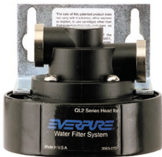
QL2 Single Head: EV9272-18

Filter head exclusively for Everpure replacement cartridges